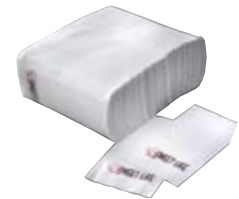
Example of poly sleeve packaging